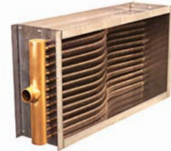
Standard Steam with Spiral Wrapped Flexible Tubes