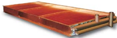
Condenser with All Copper Construction