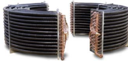
Evaporator with 10' Overall Diameter and Spiral Wrapped Tubes